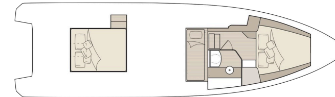
02 Lower deck with aft cabin